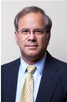
Thomas A. Remick Chair

Engineering Section Leader, Arizona Public Service, Palo Verde Nuclear Generating Station